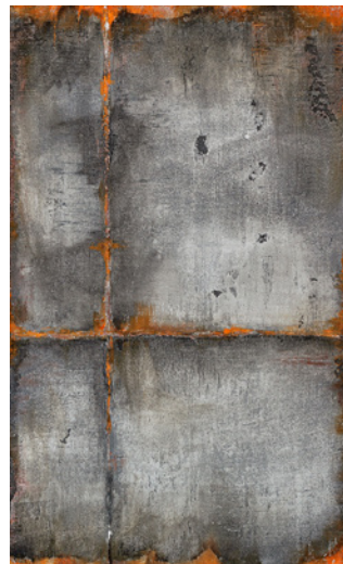
Intonachino Fine #7