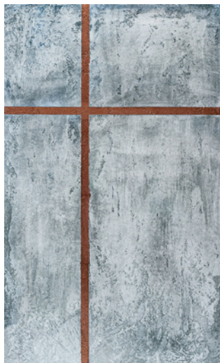
Intonachino Fine #2