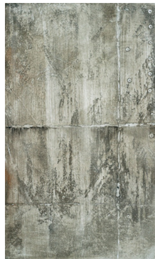
Intonachino Fine #4