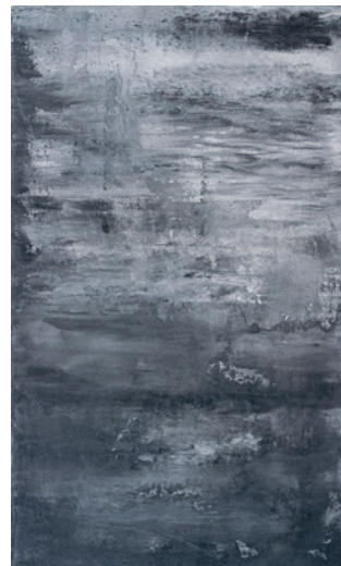
Intonachino Fine + Velvet #1