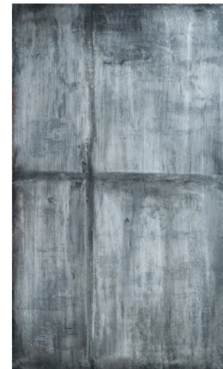
Intonachino Fine #1