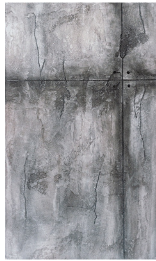
Intonachino Fine Base