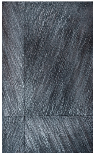
Intonachino Fine #6