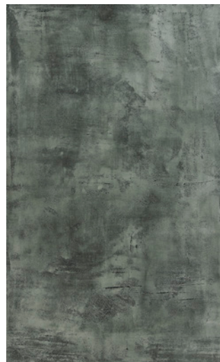
Intonachino Fine + Velvet #2