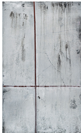
Intonachino Fine #3