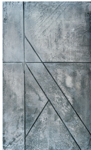
Intonachino Fine + Fantasy