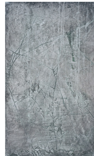
Intonachino Fine #5